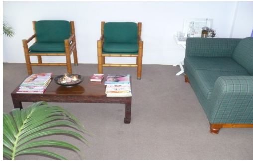
View of waiting room

The Centre offers a comfortable waiting area with herbal tea, cold water and relaxing music for waiting clients.