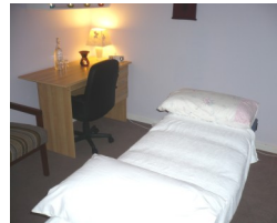
Massage therapy room setup.

There are four private and well maintained therapy rooms (3.2 x 2.8 meters) suitable for all health modalities.