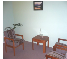
An example of a counselling or similar therapy room.